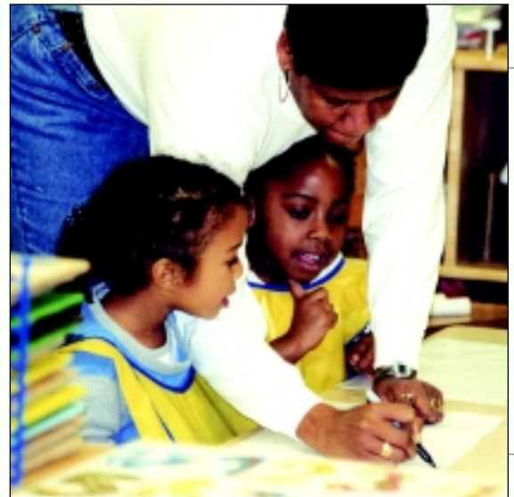
Four-year-olds benefiting from lottery-funded program at "Sheltering Arms"

lottery dollars. The valuable educational experience they receive starting at age four, and enhanced through modern technology in school, will enable them to be future HOPE recipients!